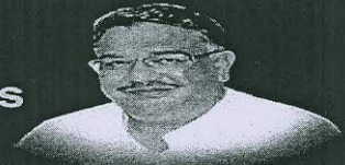
Sri Tanveer Sait Hon'ble Minister for Minorities Welfare, Waki, Primary & Secondary Education